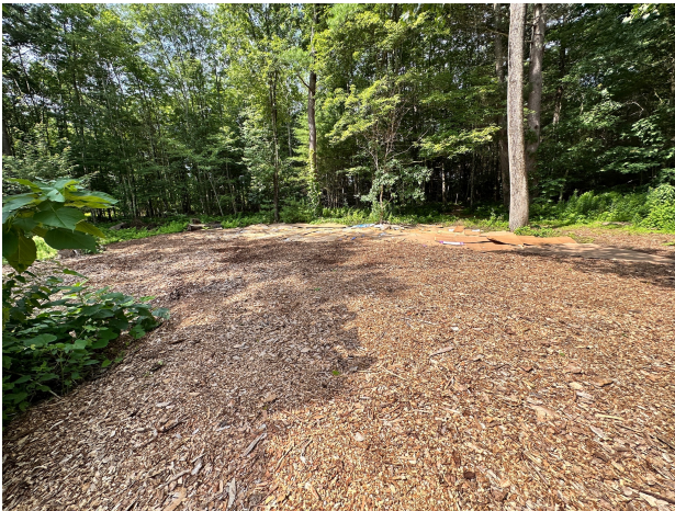
Children's Discovery Trail remediation

Please email Gabe Zorabedian if you're interested in helping out on the trails.